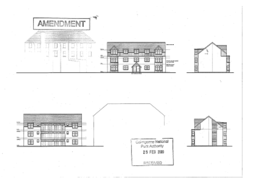
Fig. 4 Site Layout and Front and Rear Elevations