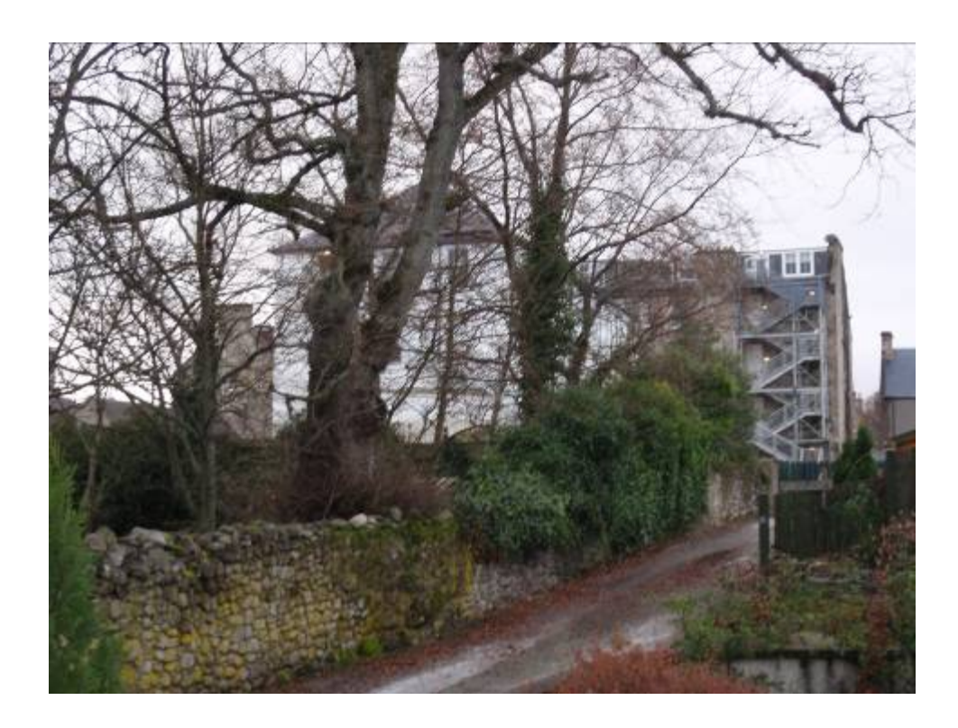
Fig.3 The site looking North West from South Street