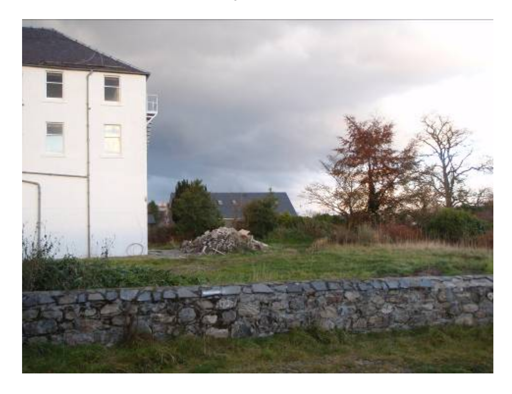
Fig.2 The site looking North East